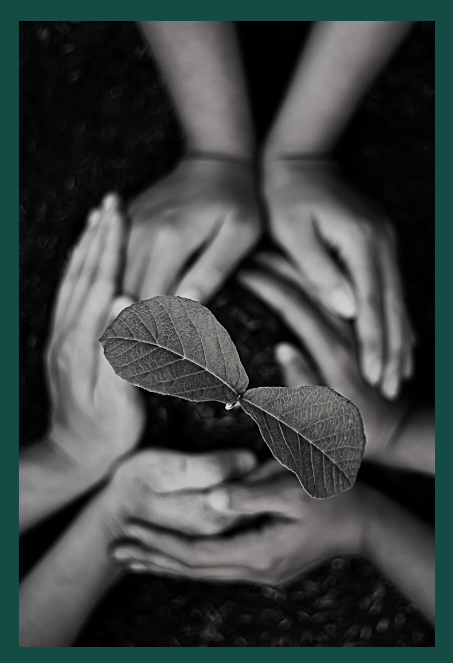
Plant the seed today; reap the benefits tomorrow.

"SW Capital came about as a way to assist everyday people, like yourself, grow their wealth for retirement through property investment using their Self-Managed Super Fund."